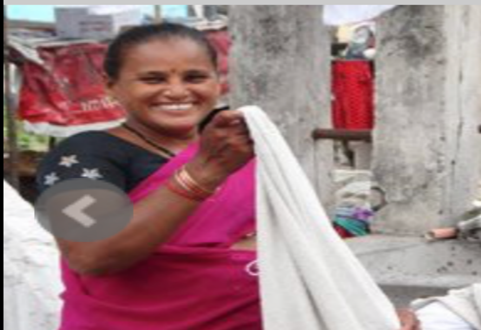
Dhobi (Hindu traditions) in India

Bringing definition to the unfinished task