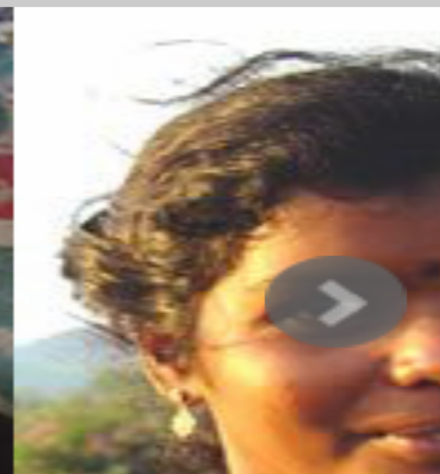
Madiga (H traditions) in