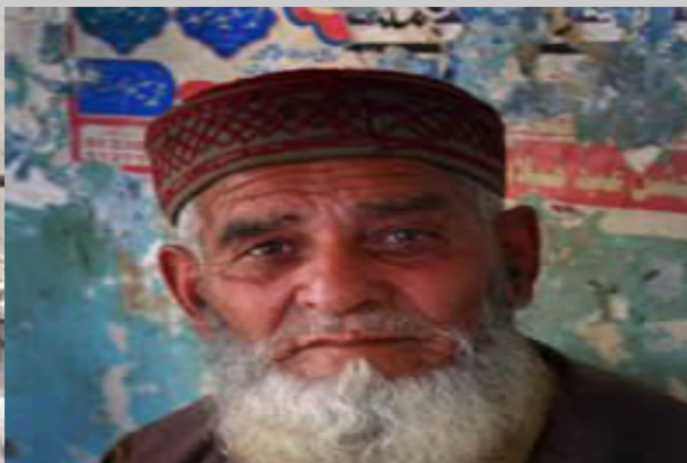
Jat (Muslim traditions) in Pakistan